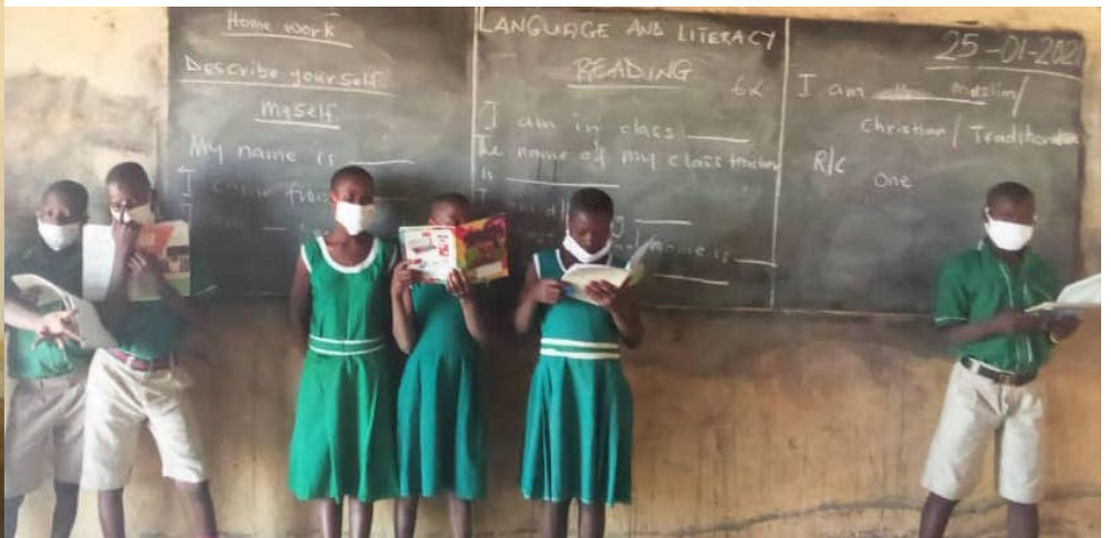
Gbenfu classes resuming...